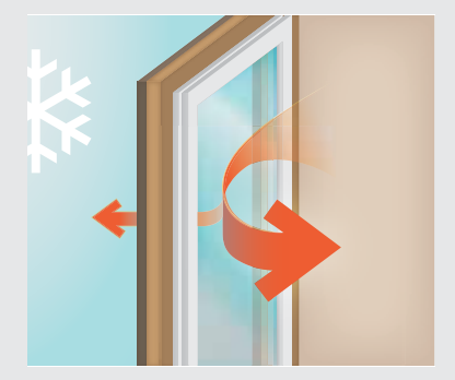
In cold weather, Low-E glass can help reduce the loss of heat by reflecting the heat back inside the home.

Factory-coated Low-E glass delivers exceptional energy efficiency. Available in Classic-Craft, Fiber-Classic, Smooth-Star, Profiles, Traditions and Pulse. Look for the (*) icon.