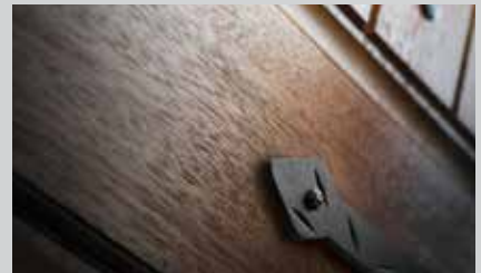
Left: Classic-Craft Canvas Collection, Augustine Glass, Door – CCV806027