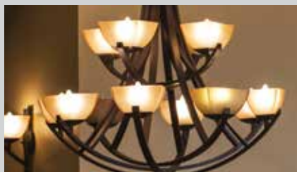
Right: Smooth-Star, Sedona Glass with Flat Lite Frame, Door – S2650, Sidelites – S139SL