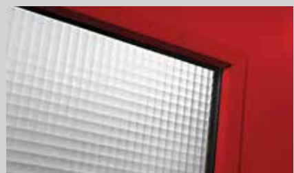
Right: Pulse Linea, Geometric Glass with Flat Lite Frame, Doors – FCM81RXG, FCM81LXG