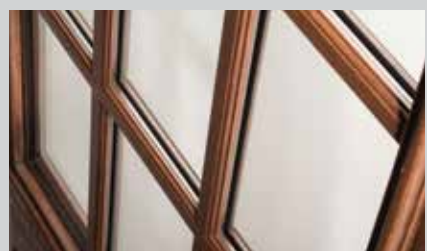
Left: Smooth-Star, Clear Glass with SDLs, Doors – S2103