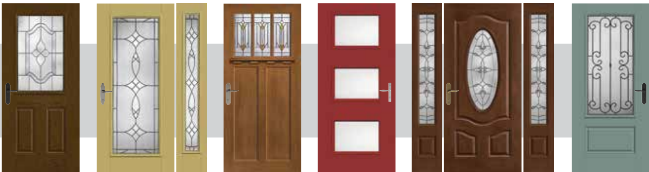
Top: Classic-Rustic Collection, Zaha Glass, Door – CCR1851, Sidelites – CCR1851SL

■ Download the full Architectural Home Styles Guide at www.homestyles.thermatru.com .