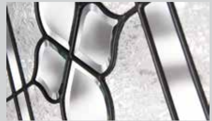
Left: Classic-Craft Rustic Collection, Provincial Glass, Doors – CCR804028